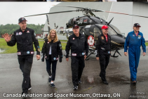
Canada Aviation and Space Museum, Ottawa, ON