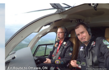
En Route to Ottawa, ON

FAI Exceptional Air Sports Performance: First Canadian Circumnavigation in Helicopter Guinness World Record: First Father and Son to Circumnavigate the World by Aircraft