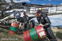
Hebron Fjord, NL