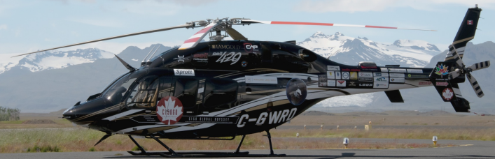
Hornafjörður Airport, Höfn, Iceland