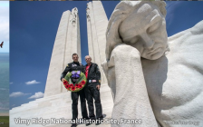
Willy-Breitschiff National Historical Site, France