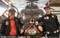
Bolton Heliport, Vaughan, ON