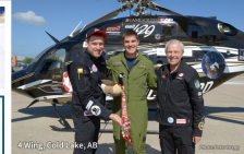
4 Wing Cold Lake, AB