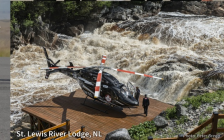
St. Lewis River Lodge, NL