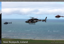
Near Reykjavik, Iceland